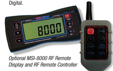
Optional MSI-8000 RF Remote Display and RF Remote Controller